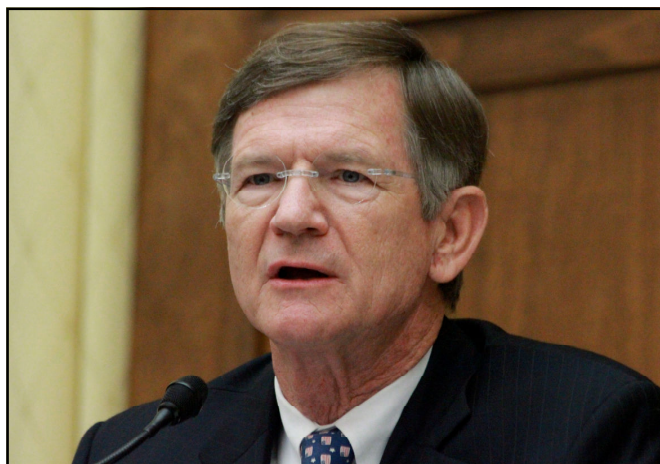
Republican Representative Lamar Smith of Texas

Lamar's bill, the High Quality Research Act, not only targets social science for eradication from the NSF, but it also has a distinctly isolationist bent. The bill's new three point criteria for funding approval states first and foremost that a project must be "in the interests of the United States to advance the national health, prosperity, or welfare, and to secure the national defense". In other words, any and all projects focused anywhere outside the USA would be rejected.