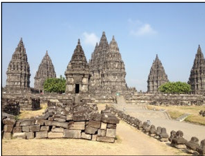
Prambanan, 7th century Hindu temples in Eastern Java

Why Java? Because the great city of Angkor in modern day Cambodia, where Dr. Barnhart clearly found evidence of zenith passage interaction, was founded in 802 AD by Jayavarman II, a man who spent his childhood as a captive in the royal courts of Java. In the 8 th and 9 th centuries two great families