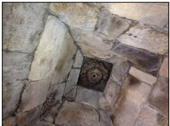
Lotus flower shaped hole in the interior roof of a temple at Candi Plaosan Lor

The team visited incredible Borobudur early in the week, suspecting its pyramid-like structure would not yield any zenith passage sighting tubes. It was the Hindu temples to the east that held that potential. After hunting through various ancient Hindu monasteries the morning of October 11 th , they entered Candi Plaosan Lor hopeful to find the roof holes they sought. But that hope faded as they saw the extreme destruction of the unconsolidated temples and learned about the reconstruction methods. Javanese archaeologists, faced with nothing but rubble piles, decided to use examples from India to reconstruct the temples. In doing so, they recreated the roof tops without the holes. Lotus flower designs with holes in the center as the interior capstones of the temples and roof stones