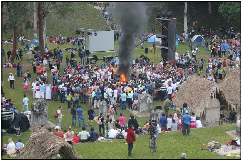
A fire ceremony in Tikal's main plaza on December 21, 2012

"There were a few thousand people about one-third Guatemalans (both Maya and Guatemaltecos), one-third gringos and one-third "back packers". On the evening of the 20 th the Guatemalan government hosted a celebration that included a speech made by the President of Guatemala and dances performed by a troupe of professional dancers.