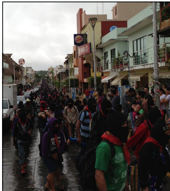
A Zapatista March in Palenque on December 21, 2012

"There was a nice fire ceremony with about 150 people in Las Sepulturas, then a local drunken murder in town which blocked traffic for everyone coming back from the fire ceremony. Eerie sacrifice."