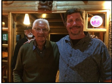
Valentin Riroroko, king of Easter Island

creased its population to over 7000 people, less than half Rapa Nui. Since the island is a territory of Chile, mainlanders seeking work in its thriving tourist industry can just pick up and move there. Though the Rapa Nui still have the exclusive rights of land ownership, many cannot resist the big profits of renting their properties to foreigners. Akiri Valentin wants the Rapa Nui people to have a voice in who gets to reside and work on the island, not just the Chilean government. If something isn't done to control migration, the Rapa Nui bloodlines will become mixed and fade completely away in just a few more generations. We wished the aging Ariki the best with his mission and told him we would spread the word of this latest challenge to his people as far as we could. Now you know too. Help us to tell the world and preserve Rapa Nui (Easter Island's local name) for the Rapa Nui people.