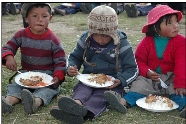
Children at Kisikancha eating a chicken lunch