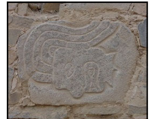
Severed head carving at Sechin

It was after sunset when we made it to the Casma Valley, where we barely made our hotel's dinner hours and flopped into our beds. Casma was our overnight choice because of our next remote site – the ruins of Sechin. There are three Sechin sites, but our destination was Cerro Sechin because of its distinction as the first city to carve scenes of violence along Peru's northern coast. Sometime about 1900 BC, Cerro Sechin covered the exterior of a palace-like structure with images of men brandishing weapons and severed heads. As I hoped, our actual visit to the site enlightened us to what our books did not explain. Walking around the structure where the carvings still stand, we could see that archaeologists had unearthed the images from underneath a subsequent building phase