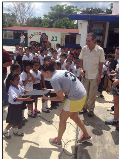
Laptop giving ceremony at San Angel

MEC's second act of support in 2014 was a true community effort. In early 2014, Maya for Ancient Mayan (MAM) launched an Indiegogo crowdfunding campaign to raise money in support of the first ever all-Maya conference of Maya epigraphers. MEC donated $500 to their campaign and then reached out to our community to help out as well. To our delight, you responded with an addition $3000 in support for the conference! The meeting took place successfully in Ocosingo, Chiapas with 110 Maya teachers and students in attendance. With that success under their belts, they announced that their next conference will be held in Guatemala in 2016. This time it will be not just taught, but also completely organized and hosted by its Maya leaders. It's a true Maya revival and the MEC community can proud to have sponsored it.