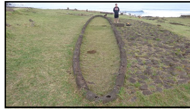
A ancient Rapa Nui house foundation