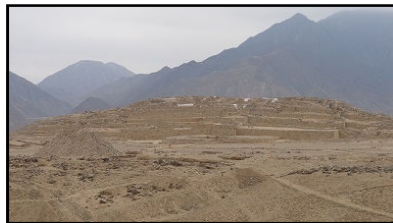
A view across the ruins of Caral