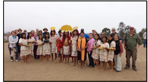
A photo with the high school Chimú performers

Their teachers were judging a contest for which team could recreate the most authentic ancient Chimú religious procession. As usual, we were the only tourists there. Still, our group of 18 was a welcome audience for their efforts and we ended up taking photos with them on the temple top.